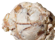
Peanut Butter & Fudge