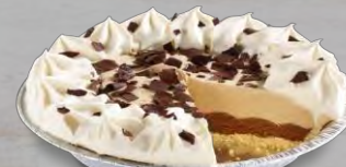
20302 Dulce de Leche Pie

TERMS & CONDITIONS: Valid only for product codes listed in this offer. Promotion period is June 1, 2024-December 31, 2024. All items listed on this offer can be purchased at any time during the promotional period. Offer applies only to foodservice operators, and payment must be sent directly to the operator. One coupon/redemption per location or headquarters address. Headquarters may submit for multiple locations and request one combined rebate check; however, reporting must show individual store addresses and purchase information. This offer is not valid for school or military bids and operator members of Group Purchasing Organizations. Offer does not apply to Resale, Bid Contract Business, National Accounts and Franchise affiliated groups. Any other use constitutes fraud. Sara Lee Frozen Bakery Teams has final decision on the interpretation of the terms & conditions of this program and reserves the right to cancel this program at any time. Void where prohibited. Distributor invoices or tracking reports must accompany rebate form and include Sara Lee Frozen Bakery item numbers, operator & distributor, business name and appropriate purchase dates. Submission must be postmarked by January 31, 2025. Allow 68 weeks for fulfillment. Not valid in conjunction with any other Sara Lee Frozen Bakery offer. Limit $500.