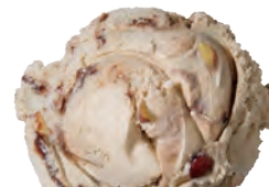
Mocha Almond Fudge