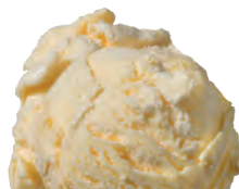
French Vanilla Frozen Custard