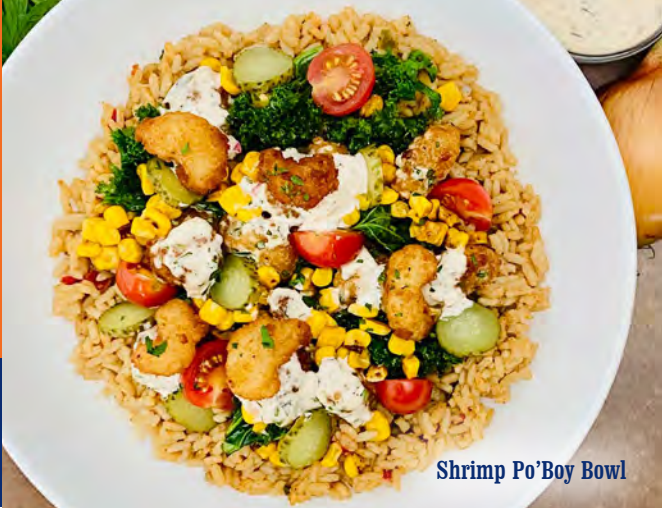
Shrimp Po'Boy Bowl

Eligible products purchased January 1, 2024-December 31, 2024. Postmarked by January 31, 2025.