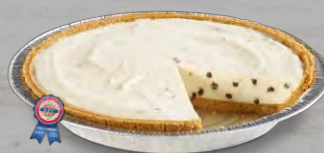
20300 Sweet Ricotta & Chocolate Chip Pie