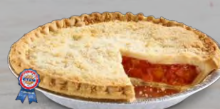
20301 Tropical Strawberry & Mango Pie