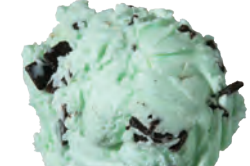
Mint Chocolate Chip